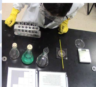
Figure 2. Real-life laboratory