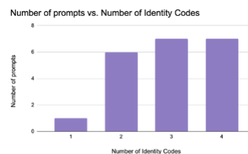
Figure 1. Number of identity codes per prompt.

The total number of codes is greater than 21 because some prompts received more