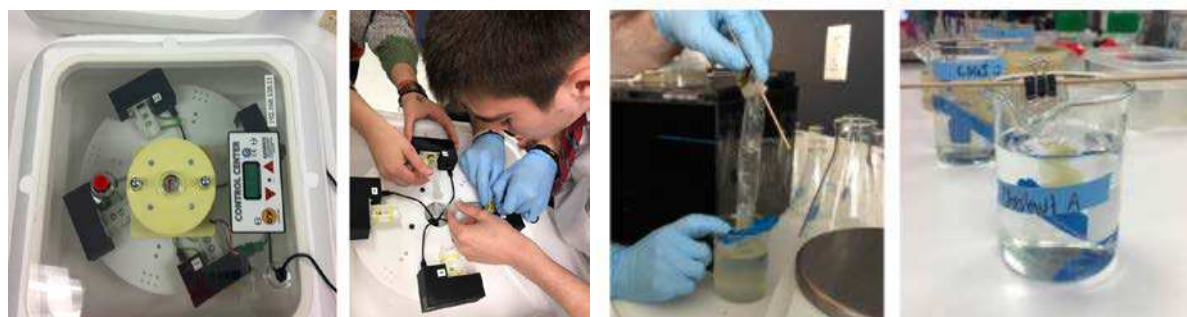
Figure 4 (a-d). BioSensor construction using bacteria detector (from left to right): (a) Prototype of portable biomakerlab machine; (b) Students inserting the syringes into the machine; (c) Students inputting the transformed bacteria into the dialysis bag; and (d) completed sensor contraction.

or not thus indicating a high or low arabinose concentration. Furthermore, the usability of their product was arguably high within the context of the class since it fulfilled a definite function (i.e., to test for the presence of the sugar). However, opportunities for tinkering and personal expression were severely limited within this phase due to the inherent constraints of wet lab activities in terms of how quickly microbes can respond to genetic or design changes and the general irreversibility of these kinds of processes.