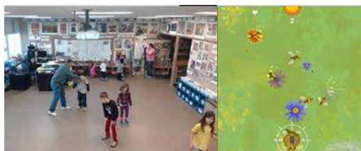
Figure 6. Students within the STEP-Bees classroom pretending to be bees (left) as they see the bees maneuvering through the virtual environment (right).

The design of the STEP-Bees environment leverages embodied activity as a tool for learning by allowing multiple students to coordinate their movements within the context of a mixed-reality participatory simulation. Two groups of 2 nd grade students (N=16, ages 7-8) participated in seven days of activities, with each group led by one of their classroom teachers. The students each took on the role of a honeybee, physically moving through the space as a bee would, foraging for nectar and communicating flower locations with their peers via a waggle dance, and their movements were tracked using computer vision and translated into an on-screen simulation which was projected in the front of the room. The overall goal of the sequence of activities was to help students explore the patterns and connections within the complex system of a beehive through coordinating their physical movements with feedback. Classroom interactions were videotaped to examine how students coordinate their actions within activities; individual pre-post interviews measured their learning gains.