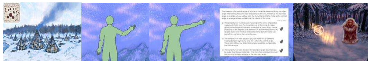
Figure 2. The Hidden Village ; (a) Scene with full village map; (b) & (c) Directed actions turn green when players’ actions match using Kinect™; (d) Conjecture multiple choice; (e) Tribal elder and earned shape.

GEMC posits that body-based (nonverbal) forms of reasoning, as exhibited by gestures that show dynamic mathematical reasoning, can allow for key mathematical insights when reasoning about geometric relationships. When motor system activation is coupled with language system activation, in the form of dialog, self-explanations, or pedagogical cues, GEMC predicts that both insight and the formulation of valid proofs will be enhanced. We explored the implications for theory and learning environment design. Specifically, GEMC-based design principles led us to make The Hidden Village , a videogame where players must copy actions of tribal village members that sometimes model relevant geometric relationships in body-based form. Shape properties are then explicitly explored when players test and justify in-game geometry conjectures (Figure 2).