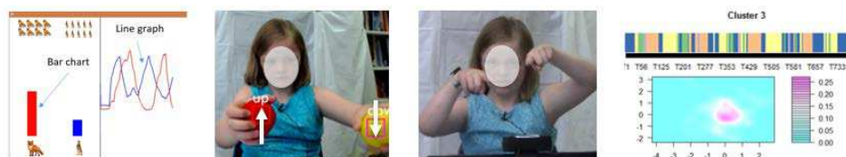
Figure 5. From left: Barchart dynamically shows predator and prey population count; a student remote-shadows the moving bars; then explains; automatically generated motion-logs show movement analytics.