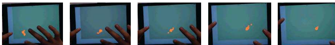
Figure 1. A student invents and uses an emergent attentional anchor to guide the enactment of proportional bimanual movement: He focuses on an imaginary line between the fingertips of his left- and right-hand indexes, keeping this imagined line at a constant angle to the x -axis while moving the line to the right.

A multiyear research collaboration between UC Berkeley and Utrecht University is pursuing the multimodal embodied roots of mathematical concepts. Complementing clinical data with action logs and eye-tracking input, we have been able to implicate subtle micro-processes in the emergence of new sensorimotor schemes anticipating effective problem solving of tablet-based manipulation tasks. In particular, we have demonstrated student construction of attentional anchors (Hutto & Sánchez-García, 2015), information-invariant constellations of environmental features facilitating the situated enactment of complex, dynamical physical actions. Our empirical work has been centered on better understanding the role of attentional anchors in conceptual development. Being design researchers, we are conducting this investigation via further developing and evaluating an educational artifact, the Mathematics Imagery Trainer (Abrahamson & Trninic, 2015).