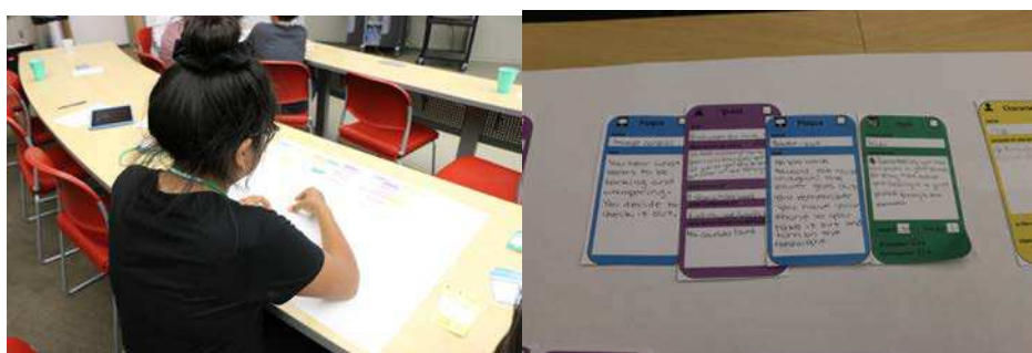
Figure 2. Youth engaged in the paper and pencil storyboarding process and close-up from Group 11's storyboard.