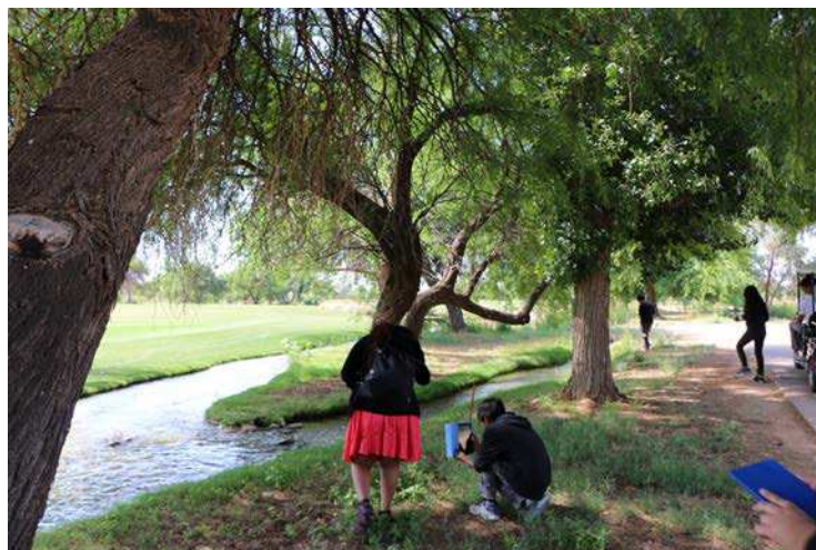
Figure 1. Youth using iPads to document the golf course during the field trip on Day 2.