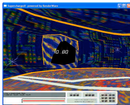
Figure 2: Screenshot of a SuperCharged! Game Play Environment