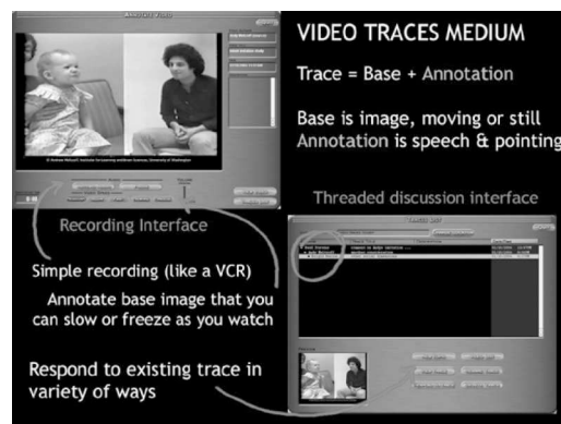
Figure 1. Video Traces software medium

The Video Traces (see Figure 1) is a software medium that gives the users ability to annotate voice, pointing, and drawing to “common objects” in visual forms such as still images and audio-video files (Stevens, 2005). The Video Traces medium supports features such as concrete and durable records of conversations and natural modalities of looking, pointing, and talking.