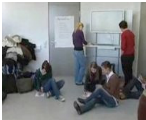
Figure 3. University Students Rather Sit on the Floor than Re-arrange the Physical Environment.

The data presented and discussed were collected in a series of three studies that were conducted in an innovative learning space that included mobile furniture and digital technologies. The studies focused on the question how innovative furniture and CSCL technologies affect learning and how they can be used to better orchestrate and foster student learning. Study 1 investigated in what way students already have access to internal scripts to use innovative furniture and CSCL technologies if confronted with them without having received instructions on how to use them. This was compared to a condition in which students received minimal instruction on the tools' functionalities. Study 2 looked at whether marginal changes in the physical lay-out of an innovative learning space has effects on group performance, individual learning outcomes and emotional well-being. For that sake, students in one condition worked on two tasks while standing at lifted desks, while students in the other condition worked while being seated at a normal desk. Study 3 investigated whether highly structured external scripts are needed in innovative learning spaces to help students produce better group output and reach higher levels of emotional well-being.