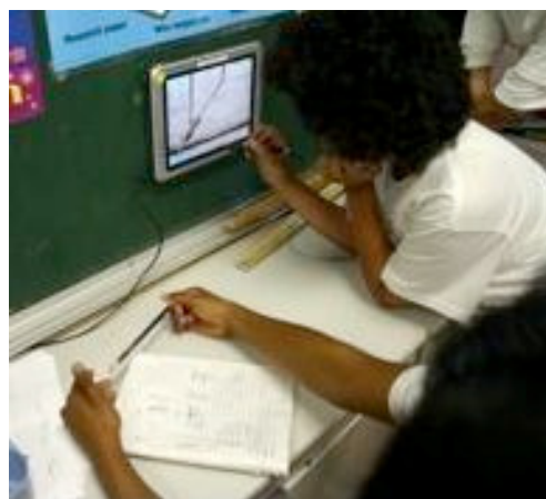
Figure 4. Students conduct sample surveys using WallScopes. Sample data are used to compute population estimates for the walls and room.

WallCology is an agent-based simulation of a small ecosystem (Moher, et al., 2008). The central conceit of WallCology is that the walls of a classroom contain a secret, controlled habitat housing a simple ecosystem of endangered flora and small fauna. The students are given collective responsibility for maintaining the viability of the resident species by monitoring those populations and adjusting the heating and lighting of the habitat. A small number of “WallScopes” (computer displays) on the walls around the room afford the visual access to small regions of dynamic behavior in the habitat at their respective locations (Figure 4). Much of the activity revolves around computing and tracking population estimates (typically a dozen times over a month) based on the samples observed through the WallScopes. The class is usually organized in groups of 3-6 students, depending on the number of available WallScopes and class size. The video here shows the work of one group of 10-11 year olds at three sequential points in their collaboration as they identify activity affordances and negotiate their respective roles in the group activity.