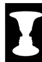
Figure 2. Rubin Vase.

To illustrate this, consider, for example, the famous Rubin Vase (see Figure 2). Perceiving the objects face or vase is not merely determined by the invariant, physical sense data (e.g., the colors, or the boundary between the colors). The same physical features support both imaginary perceptual possibilities. In order to perceive one possibility over the other, the same data has to be organized into different configurations (Gurwitsch, 1964). Organizing particular features into certain relationships with one another gives an assemblage of details coherence as an object (Garfinkel, 2008), whether it is real or imaginary.